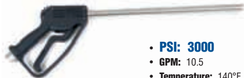
AP Single Lance Dump Gun

Water continues to run through the tube even when trigger gun is closed.