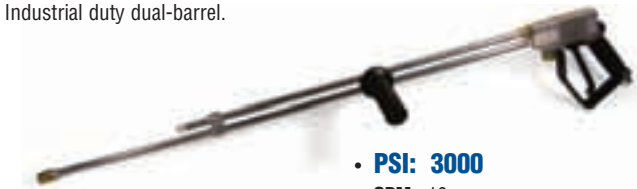
Dual Lance Dump Gun